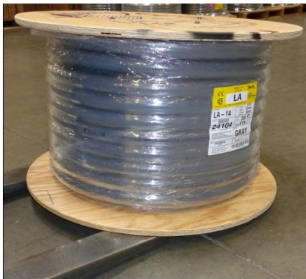
Figure 2 – Proper Way