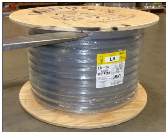
Figure 3 – Improper Way

Do Not spread the forks and pick up the reel by using the top flange. By doing this the conduit can be cut or crushed by the forks (See Figure 3).